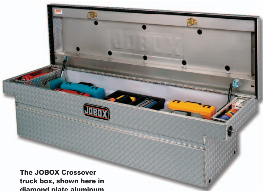
The JOBOX Crossover truck box, shown here in diamond plate aluminum.