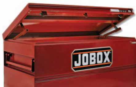
The updated JOBOX industrial storage chest now features three locking mechanisms across the front lid.